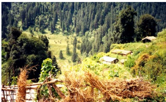
Figure 16.2 A view of a forest life

Let us take a look at what each of these groups needs/gets out of the forests. The local people need large quantities of firewood, small timber and thatch. Bamboo is used to make slats for huts, and baskets for collecting and storing food materials. Implements for agriculture, fishing and hunting are largely made of wood, also forests are sites for fishing and hunting. In addition to people gathering fruits, nuts and medicines from the forests, their cattle also graze in forest areas or feed on other fodder which is collected from forests.