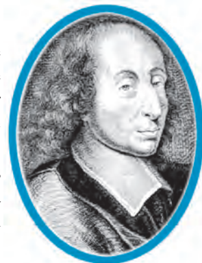
Blaise Pascal (1623-1662)

In earlier classes, we have learnt how to find the squares and cubes of binomials like a + b and a - b . Using them, we could evaluate the numerical values of numbers like (98)^2 = (100 - 2)^2 , (999)^3 = (1000 - 1)^3 , etc. However, for higher powers like (98)^5 , (101)^6 , etc., the calculations become difficult by using repeated multiplication. This difficulty was overcome by a theorem known as binomial theorem. It gives an easier way to expand (a + b)^n , where n is an integer or a rational number. In this Chapter, we study binomial theorem for positive integral indices only.