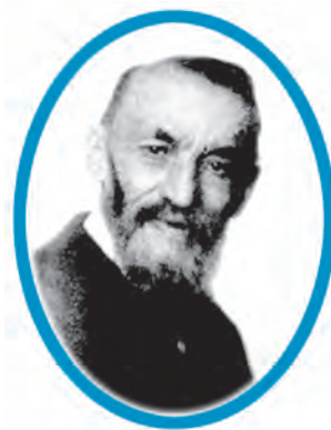
G. Peano (1858-1932)

In contrast to deduction, inductive reasoning depends on working with each case, and developing a conjecture by observing incidences till we have observed each and every case. It is frequently used in mathematics and is a key aspect of scientific reasoning, where collecting and analysing data is the norm. Thus, in simple language, we can say the word induction means the generalisation from particular cases or facts.